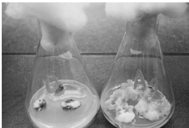
Figure 1. Growth of tobacco cells on control medium containing auxin (left) and on the same medium with addition of the silver nitrate precipitable material. This image is from the original work of Miller in 1953.

material for further studies, Skoog ordered a keg of herring sperm DNA that had been prepared by the same company using the same procedures by which the small active sample that Miller had first tested had been prepared. However, the new batch of herring sperm DNA did not possess any trace of growth-promoting activity. The excitement abated. Miller had serendipitously chosen samples of both yeast extract and herring sperm DNA with relatively high activity, but no activity was present in any newly purchased batches.